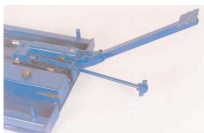
Removable & storable operator's foot pedal and lowering control on basic models.

Optional foot pedal switch available on electric models.